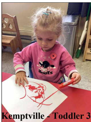
Kemptville - Toddler 3